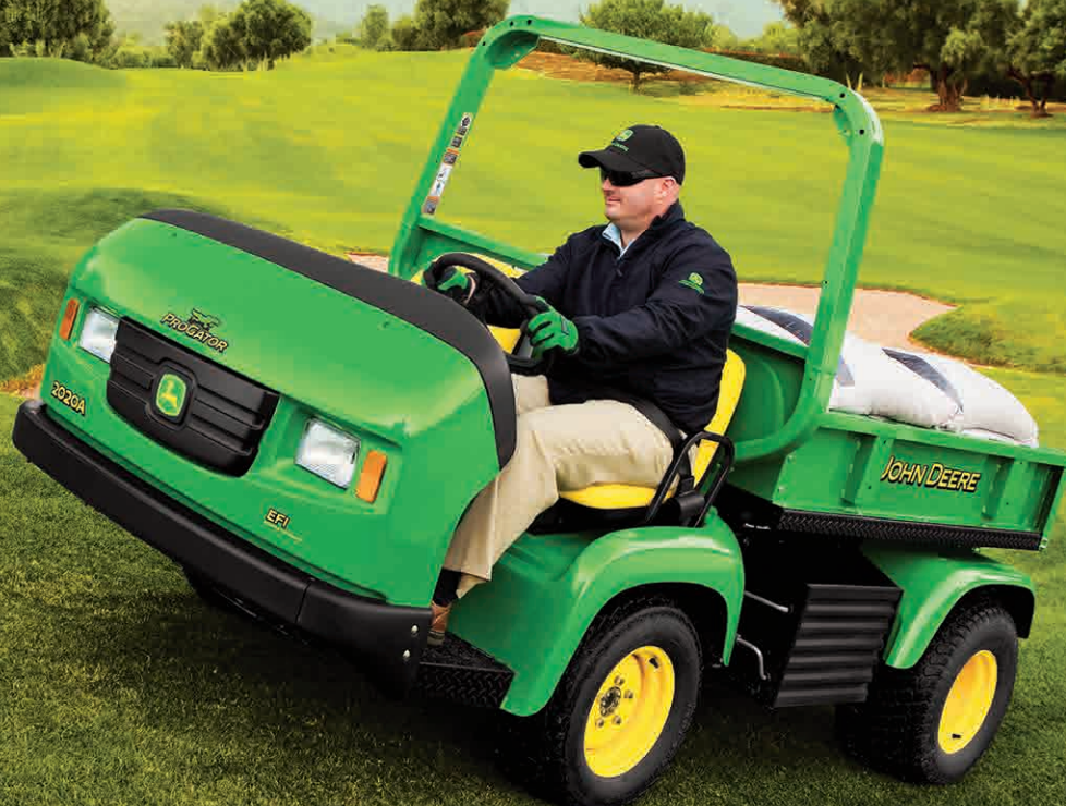
John Deere ProGator 2020A

C & B Operations 5121 Midland Rd Billings, MT 59101 (800) 823-9242